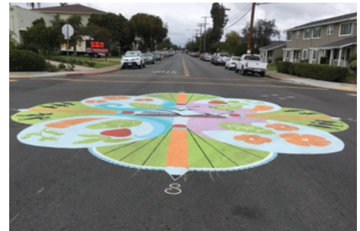
Linda Vista Intersection Mural

Key Partners Involved: Linda Vista Intersection Mural Network, Montgomery Middle School, Bayside Community Center Resident Leadership Academy, City of San Diego Arts and Culture Commission, SANDAG