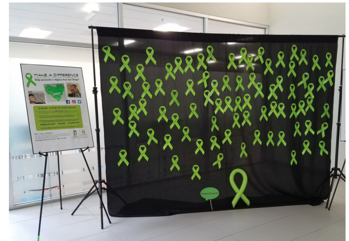
Mental Health Awareness Event

Key Partners Involved: Community Health Improvement Partners, Urban Corps of San Diego