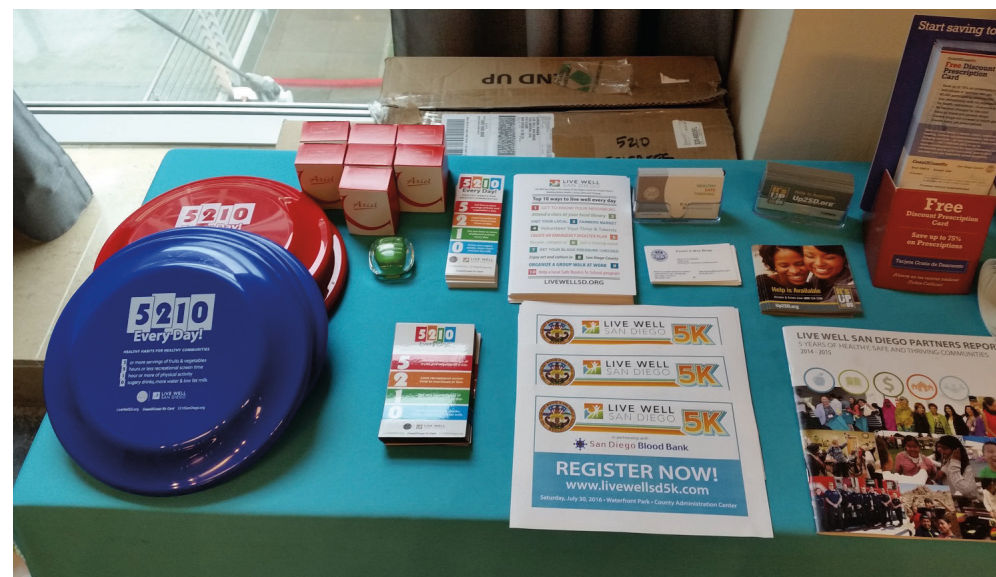
Outreach event to encourage physical activity

Key Partners Involved: Childhood Obesity Initiative, Community Health Improvement Partners, Educate to Eliminate, Family Health Centers of San Diego, Jacobs & Cushman San Diego Food Bank, SAY San Diego, Sweetwater Union High School District, San Diego Unified School District, and Grossmont Union High School District